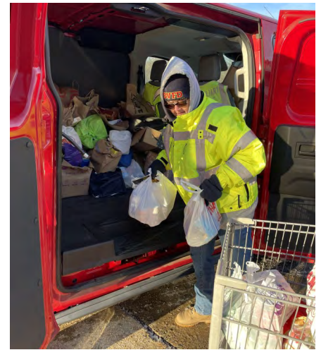
Bowie Volunteer Fire Department Santa Runs