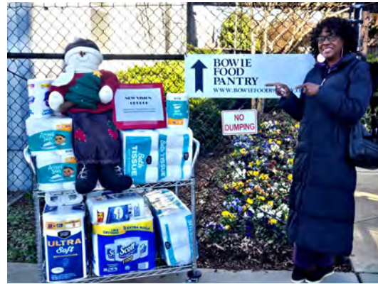
New Vision Church