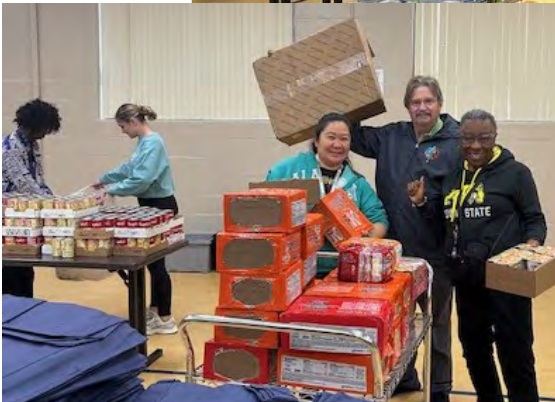
The Pantry partnered with the City of Bowie for a food distribution event in November.

Our volunteers worked through the elements with the help of a donated, heated tent!