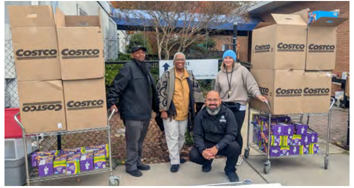
Prince George's Community Federal Credit Union