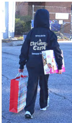
A Christmas Donation