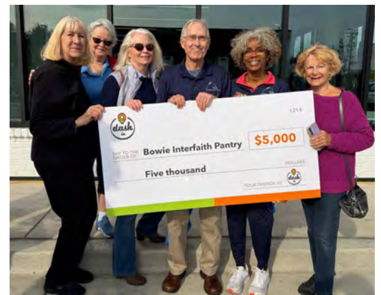
Food Pantry Volunteers Accept Check from Dash-In