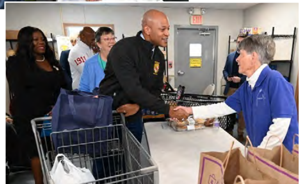
Maryland Governor, Wes Moore, greets some of our long-time volunteers during his visit in October.