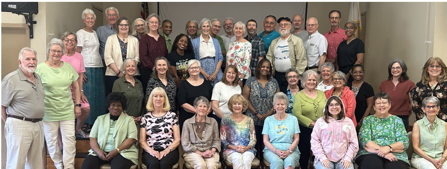
Our 2025 Volunteer Luncheon was a great opportunity to catch up.