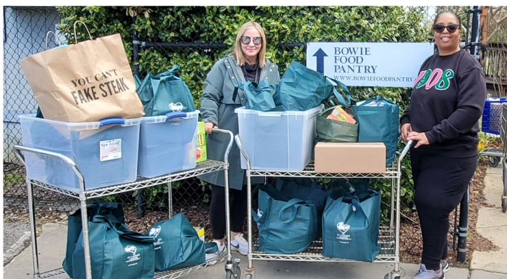
(above) Alpha Kappa Alpha Sorority Inc. —Iota Gamma Omega Chapter