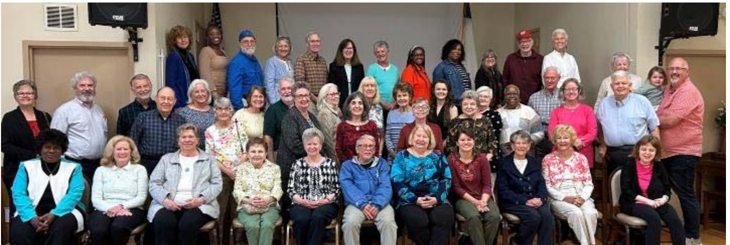
Our 2023 Volunteer Luncheon was a great opportunity to catch up.

It would be helpful if groups/individuals could check dates before bringing items to the pantry. While it is tempting to clean out your pantry and donate the food, it makes our job much harder. Anything you can do to make our job easier (and less back-breaking!) would be appreciated.