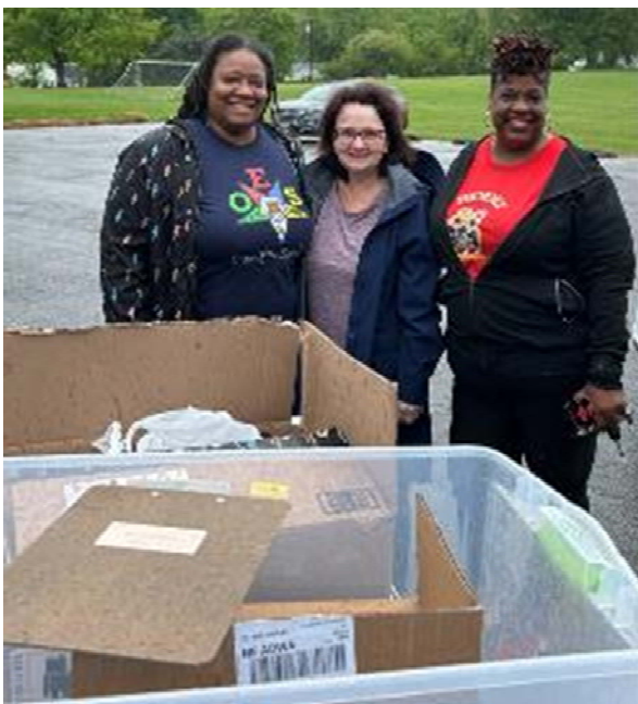
Phoenix Chapter 86 stopped by with their monthly donation for their adopted shelf.