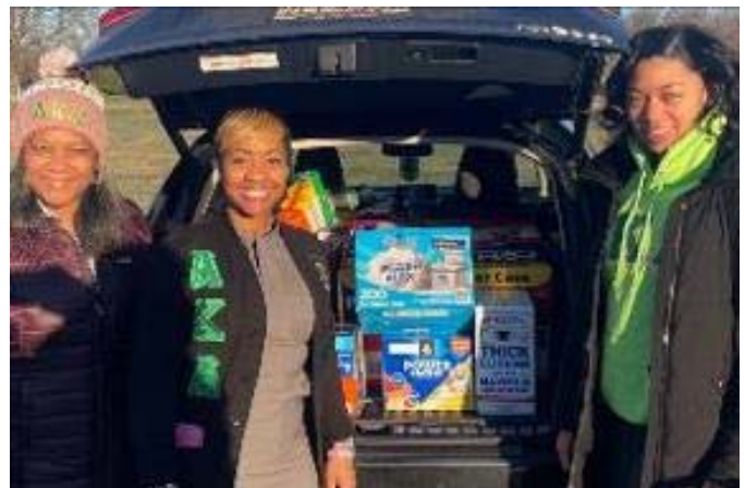
Members of the Iota Gamma Omega Chapter of Alpha Kappa Alpha Sorority, Inc. donated much needed items to the pantry.