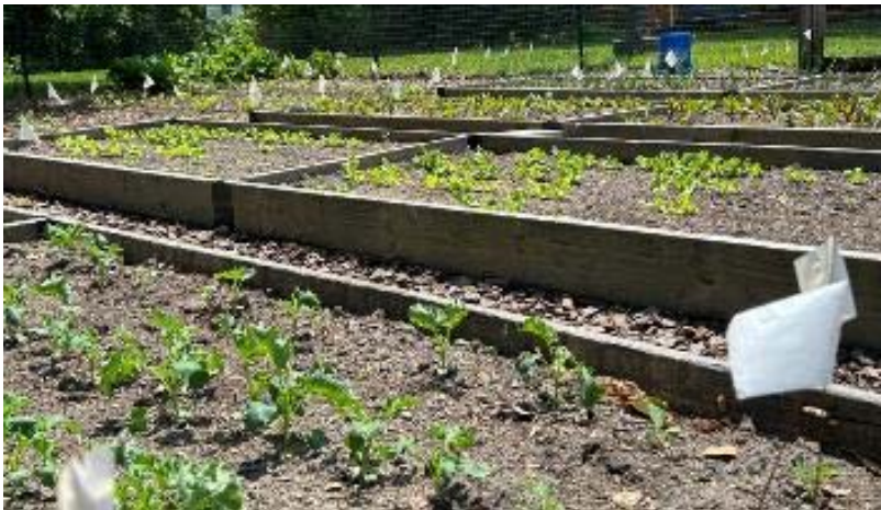
Spring crops have been planted and will be ready to harvest in a few weeks!