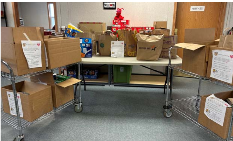
The St. Matthew's EEC Kindergarten Class held a food drive themed "Food from the Heart." Students visited the pantry and brought much-needed food for our families. Great job, everyone!

Donations of personal care items are always welcome!