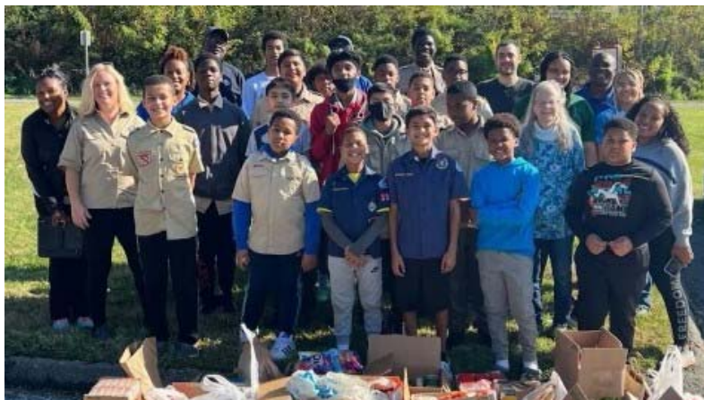
Scouting for Food