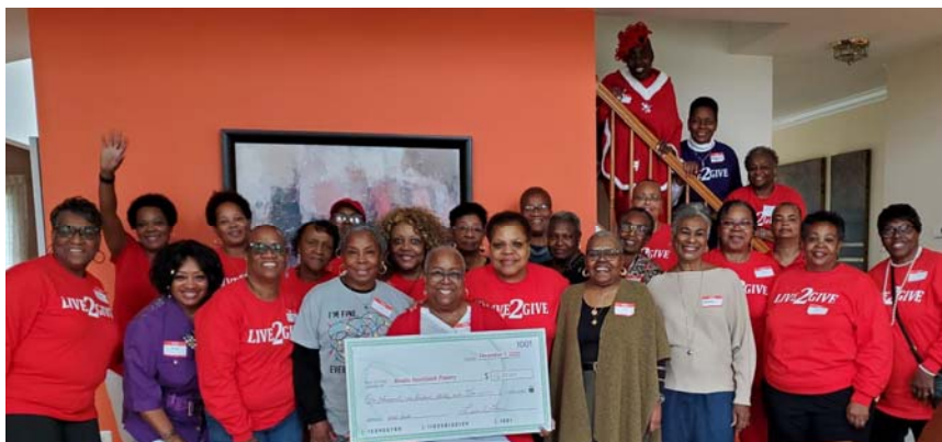
Live 2 Give