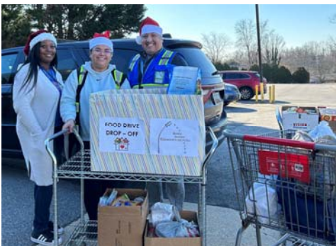
Nordstrom Distribution Center