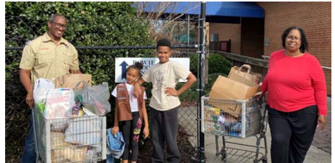
Scouting for Food