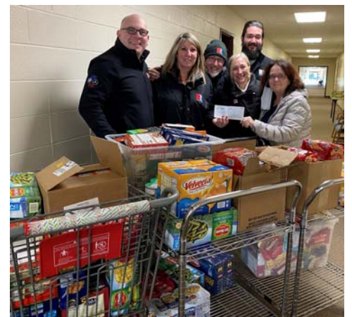
Toyota of Bowie