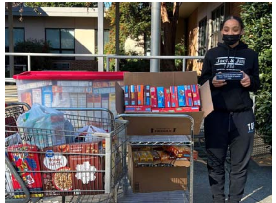
Jack and Jill—Greater Suburban MD Chapter