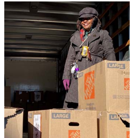
CMIT South Elementary School