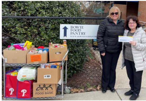
NASA Federal Credit Union