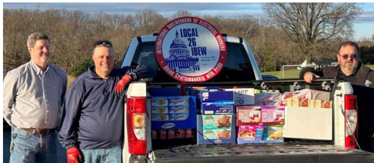
IBEW Local 26