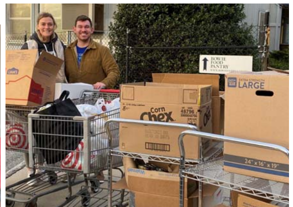
Frederick Douglass High School