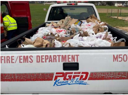
Bowie VFD—Santa Rides