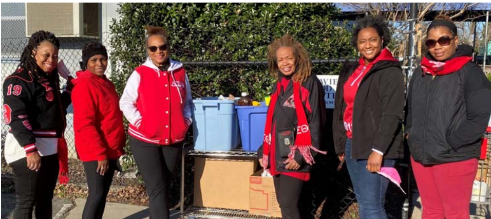
Delta Sigma Theta Sorority