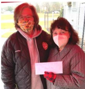
The Bowie Volunteer Fire Department presented the pantry with a donation - Operation Surprise!