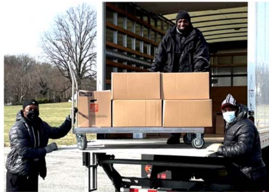
First Baptist Church of Glenarden held a food drive for the pantry and also donated mugs filled with goodies for our Seniors and homeless bags.