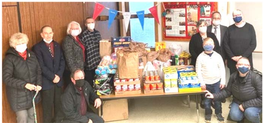
First Lutheran Church of Bowie held a food drive for the pantry in December.