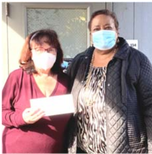
The Rotary Club of Prince George's County presented a donation to the pantry for the holidays.