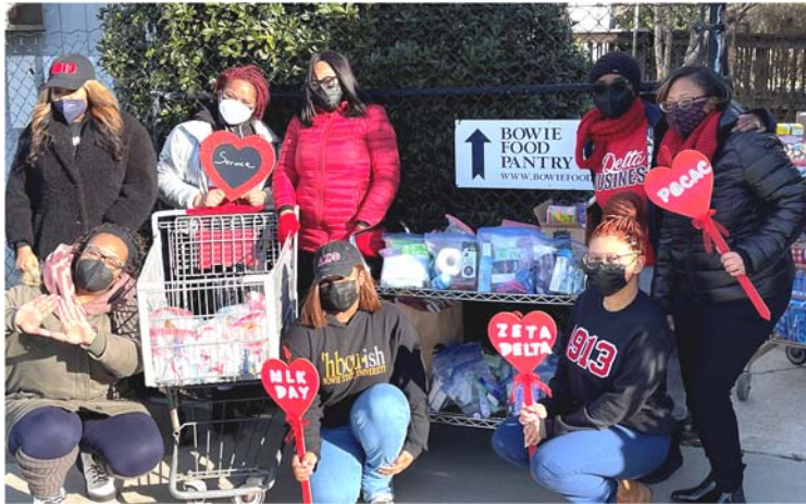
Members of Delta Sigma Theta Sorority, Inc. Prince George's County Alumnae Chapter and Zelta Delta Chapter collected and put together toiletry kits for our families.