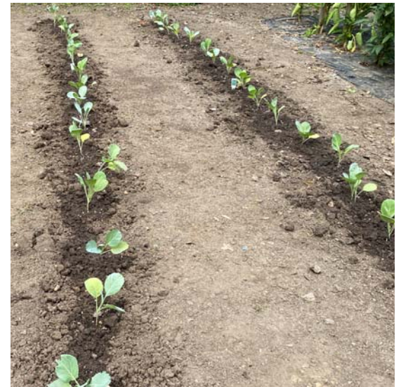
Gardeners have planted fall crops including collards, kale, broccoli, swiss chard and lettuce