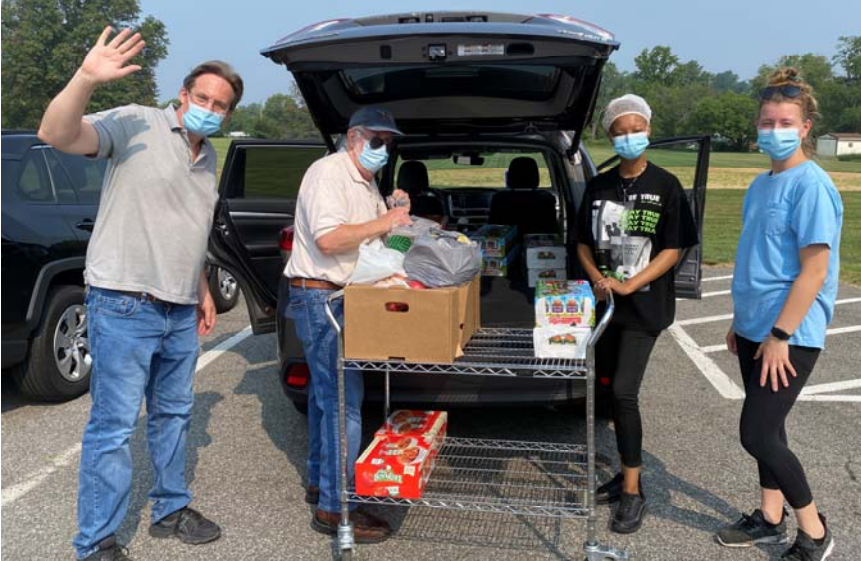
Heaven Sent Cupcakery continues to bring donations to the food pantry! We appreciate your efforts!