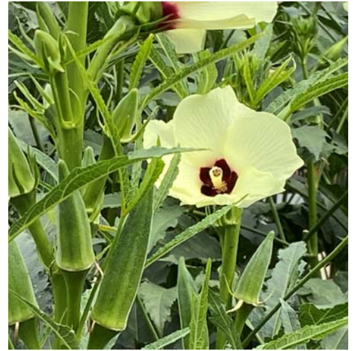
Our okra crop continues to blossom.