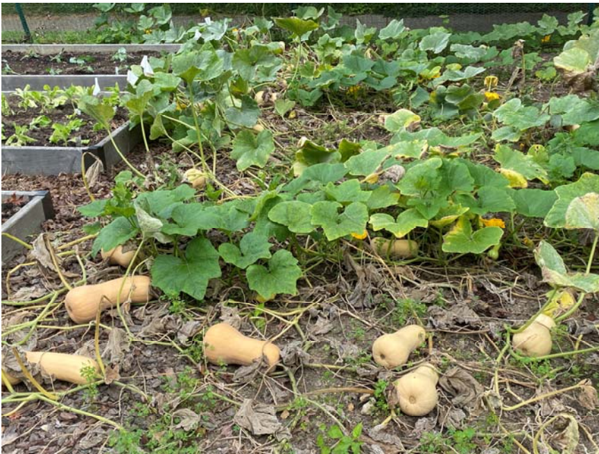
Can't wait for our families to enjoy some butternut squash!