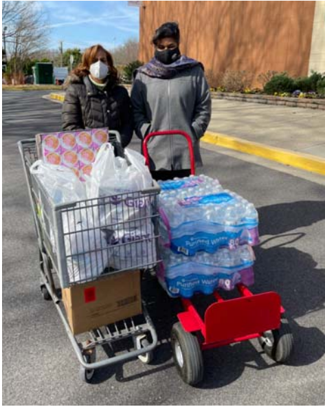
Members of Mount Rose MD Chapter of Links, Inc. continue to bring donations to the Pantry.