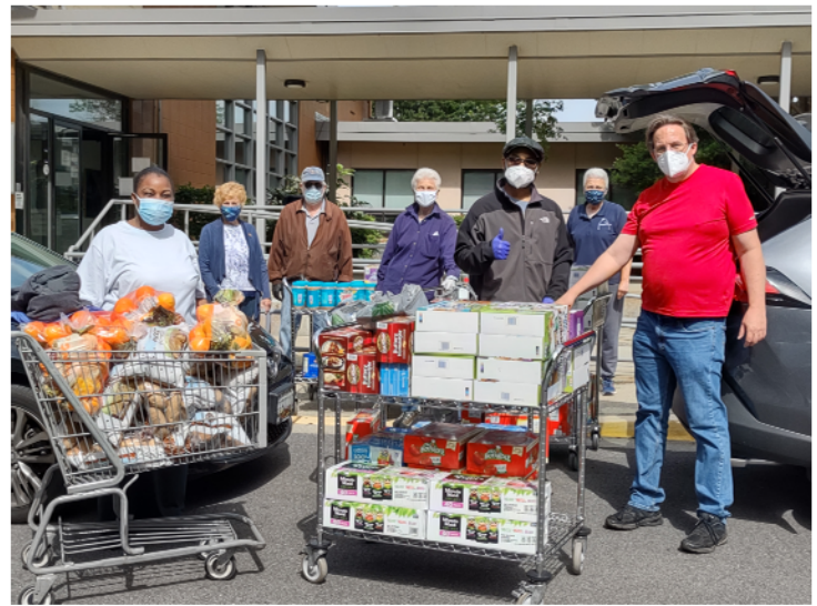
Another great donation from Heaven Sent Cupcakery.