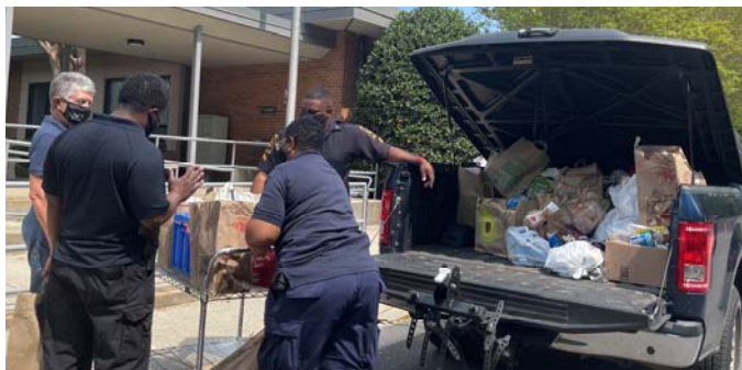
The City of Bowie Police Department recently held a food drive for the pantry. It was a huge success; many thanks to all those who participated.