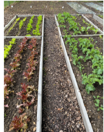
We anxiously await fresh produce from our pantry gardens.