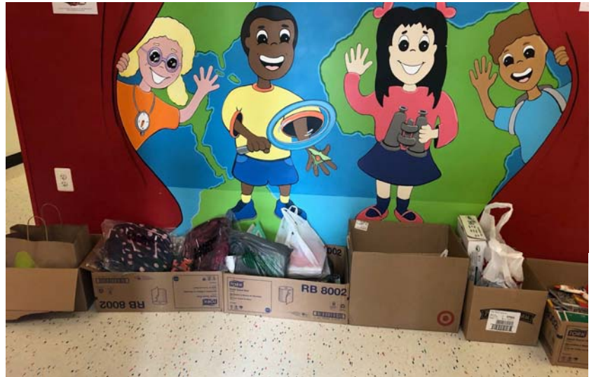
The Goddard School collected many boxes of school supplies for the Pantry.