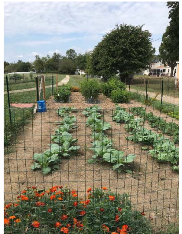
Our garden continues to produce fresh vegetables for our families.