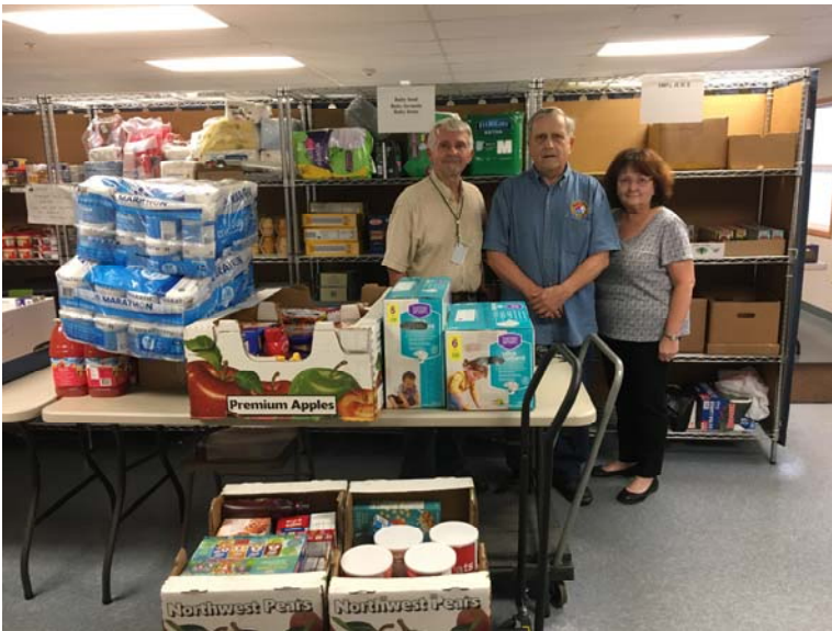
The Berwyn Rod and Gun Club continues its tremendous support of the Pantry with another donation of food and money.