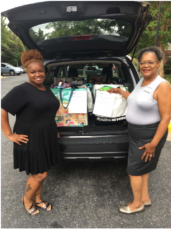
Residents of The Willows provided a carload of school supplies for the Pantry.