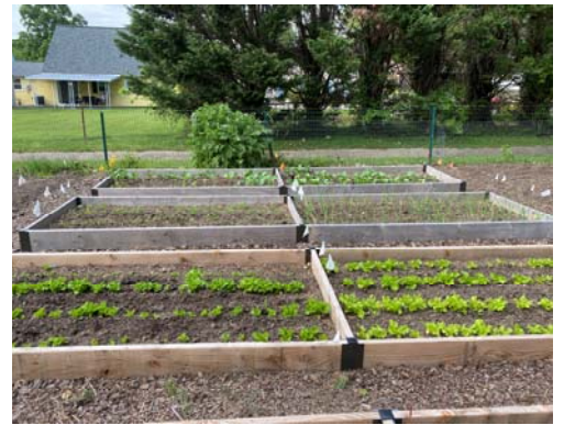
The pantry garden has been prepped and planted. Many thanks to our gardeners led by John Teasdale. We are looking forward to harvest time!