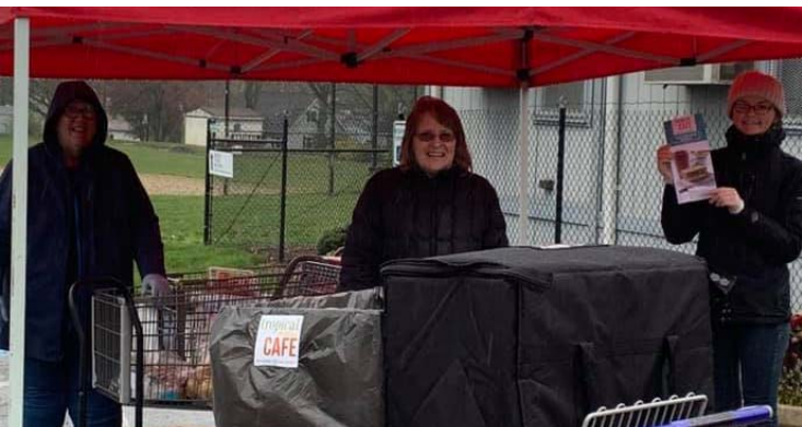
Tropical Smoothie Café brought some love and support to the Wednesday volunteers. Thank you for the delicious smoothies and boxed lunches!

DONATIONS can be brought to the Pantry M, W, F mornings 8 am-12:30 pm and on the 2 nd and 4 th Tuesdays from 5-7 pm. Please drive to the parking area by the ballfields and remain in your car. A volunteer will come and take the food from your car.