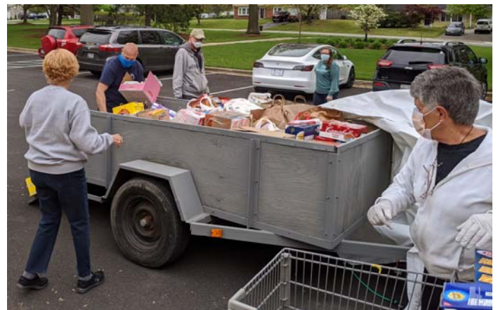
Grace Baptist Church held a community food drive in April for the Pantry. Many thanks to all those who dropped off food at Jireh Place.