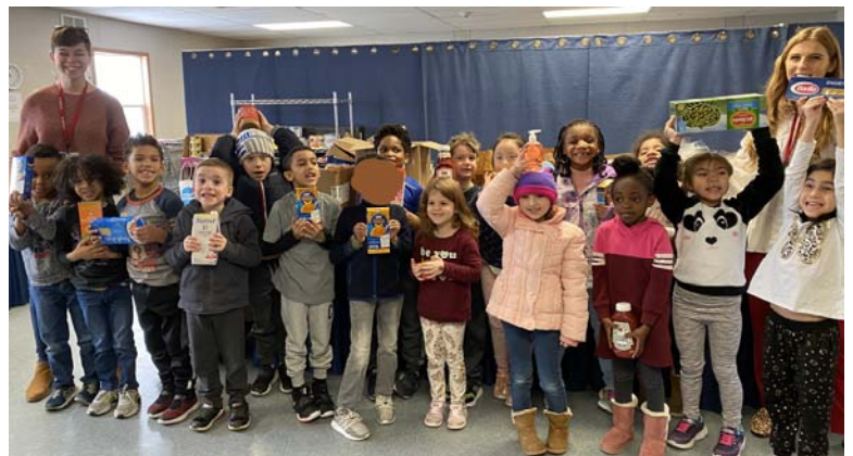
Kindergarten students from St. Matthew's EEC program visited the Pantry along with their parents and teachers. Students collected over 550 food items for the Pantry!