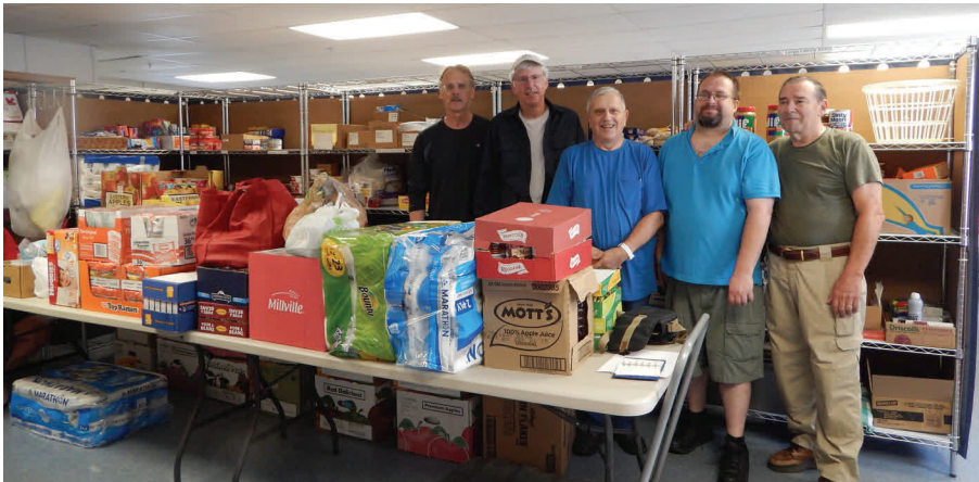
On September 3, The Berwyn Rod and Gun Club held a food drive to benefit the Food Pantry. Members brought the HUGE donation to the Pantry on September 5.

Berwyn Rod and Gun Club have been longtime supporters of the Pantry, and we appreciate their efforts to help those in need.