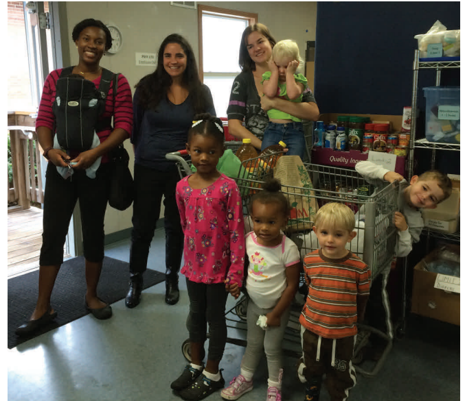
South Bowie MOM's Club brought donations to the Pantry. The children enjoyed touring the facility and identifying fresh vegetables!