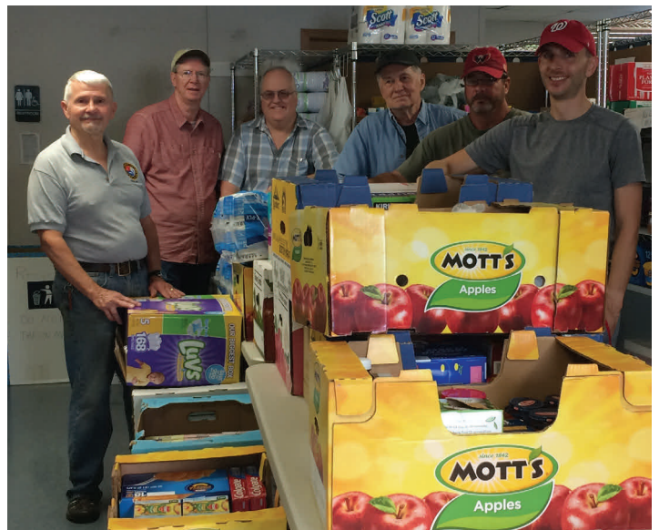
Berwyn Rod and Gun Club does it again; their food collections stock our shelves when we need it the most!