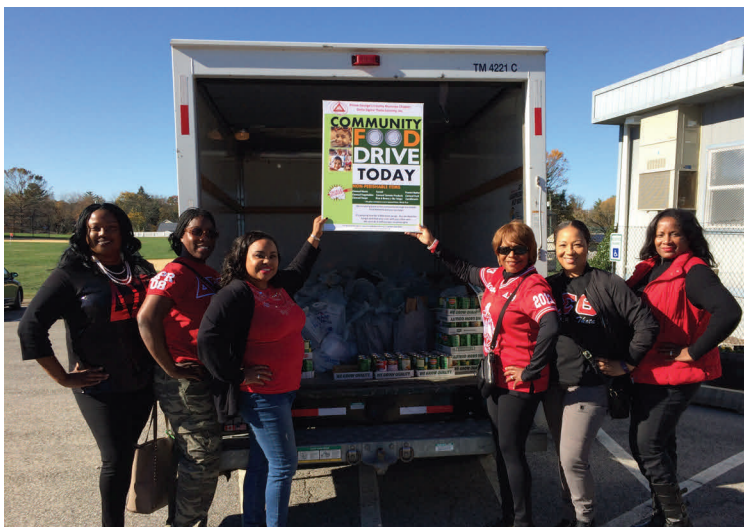
Delta Sigma Theta Sorority's annual community food drive brought lots of veggies and other food items to the Pantry. Thanks to all who spent the day at Wal-Mart collecting food for the Pantry