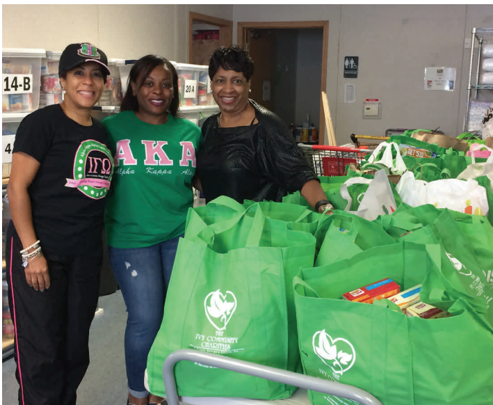
Members of Alpha Kappa Alpha Sorority held their annual food drive to benefit the pantry; it was a great success as always!