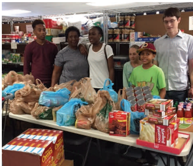
Bowie City Church members went shopping at local stores on October 30. Members focused on our greatest needs including cereal, rice, applesauce, granola bars, and soup.

We also need wrapping paper, tags, bows, gift bags, etc. Items should be brought to the Pantry no later than December 16. Our children range in age from infant to 18; we especially need items for middle and high school students.