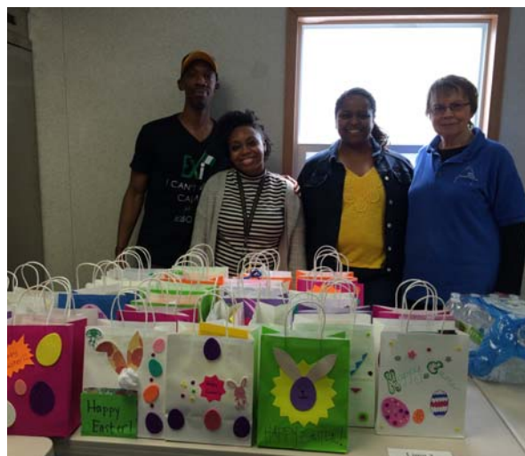
Members of the Bowie State University's Golden Key International Honour Society made lovely Easter Goodie Bags for our children. The Honour Society has made this an annual project, and we look forward to seeing them each spring.