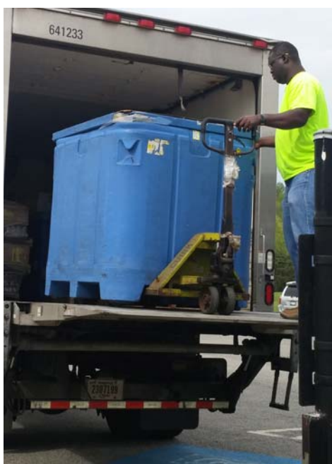
DPI Specialty Foods held a food collection for the Pantry. Employees unloaded 3 tubs of frozen food and 15 pallets of food. INCREDIBLE DAY!