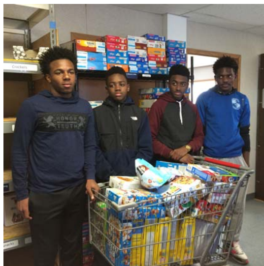
Members of GSM Group recently toured the Pantry and donated cereal. The Group is participating in our Adopt-A-Shelf program.