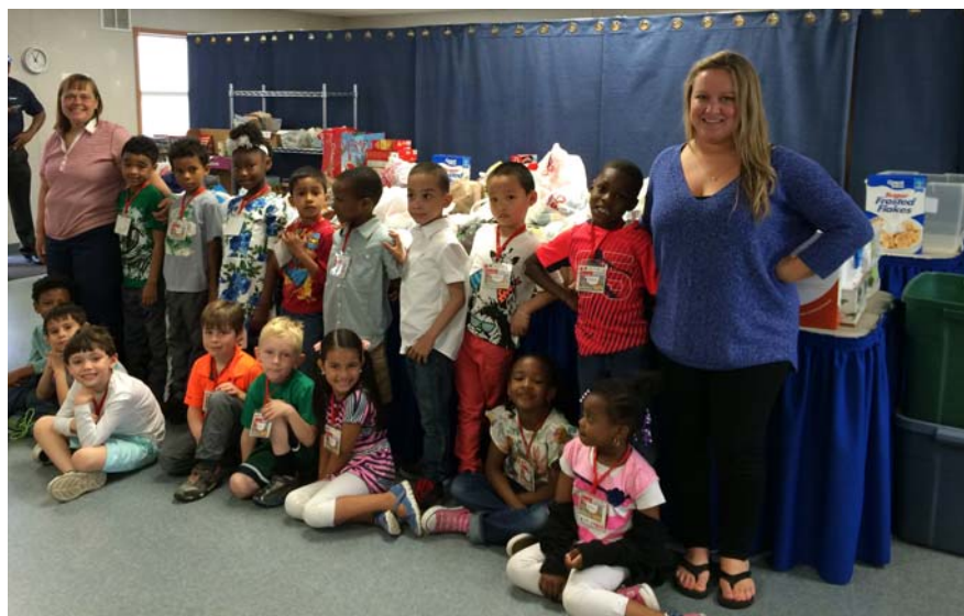
St. Matthew's Kindergarten class toured the Pantry in April and collected LOTS of food for the Pantry.