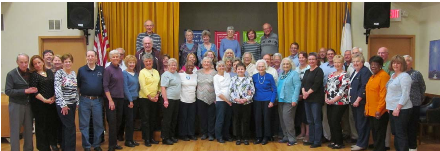
59 of our 113 Pantry volunteers gathered for our annual luncheon. We have the greatest and best looking volunteers around!