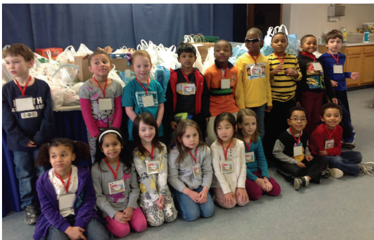
Each spring students from St. Matthew's Early Education Center visit the Pantry. They collected over 550 food items and brought them to us on March 27. Great job!