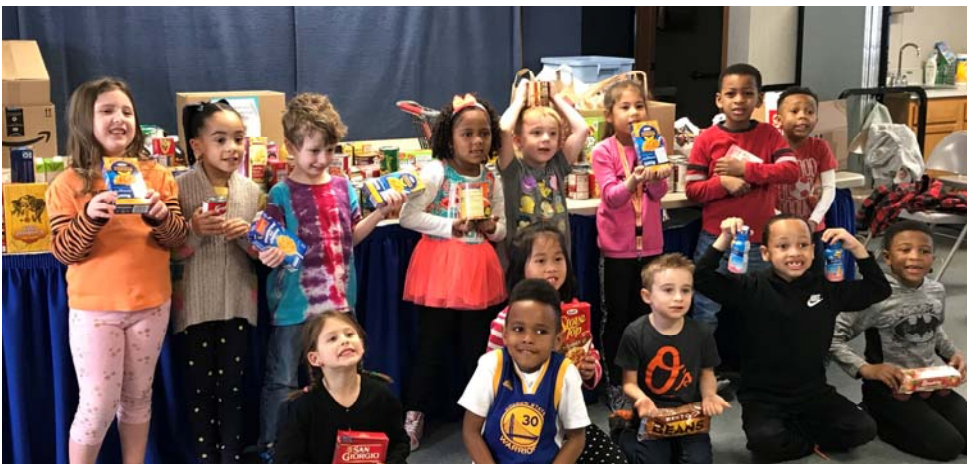
The St. Matthew's EEC Kindergarten class, teachers and parents visited the Pantry in March. They brought us lots of food for our families and children to enjoy.