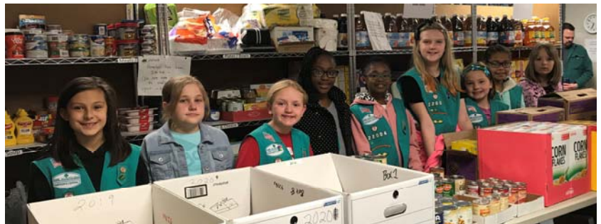
Girl Scout Troop 22004 donated Girl Scout Cookies and other food items in April. The scouts also toured our Pantry and garden.

Please contact the Pantry for additional information. We will send you the link to Sign Up Genius.