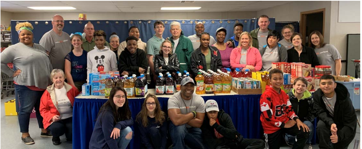
Bowie City Church members went shopping for the Pantry on Sunday, March 31. They focused on our most needed items which included 100% juice, condiments, desserts and dry goods. They did a great job!