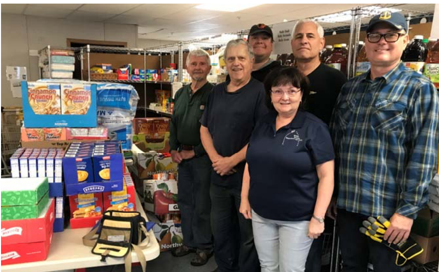
Berwyn Rod and Gun Club members brought up a LARGE donation of food, personal care items, and diapers as well as a monetary donation. Items were collected at their May meeting. We appreciate their continued support.