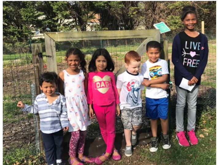
The Bowie MOMs Club made beautiful Easter baskets for our children and toured the Pantry. Members also visited our garden where our spring crops are growing.

Don't forget - the Pantry accepts travel size shampoo, conditioner, soap, lotion, etc. in addition to regular size personal care items. Our supply of travel size items is dwindling so remember us and don't leave those items behind in the hotel room!