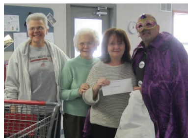
“Hunger Man” visits the Pantry

CROP Walk 2013 was a huge success! We received a check in the amount of $3,669.34 from Church World Service who sponsors the event. Special thanks to all those who walked on behalf of the Pantry. We rely on your support year after year.