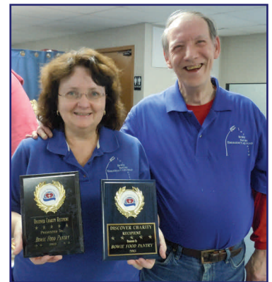
Discover Charity Recipient Bowie Food Pantry January 15, 2014

The Bowie Spring 5K Run/2-Mile Walk will be held on Saturday, March 29, at 8:00 a.m. at the Bowie Town Center. Preregistration is $25; on-site registration is $30 or $25 with a canned food donation. Preregister at www.active.com/bowie-md/running/distance-running-races/bowie-annual-spring-5k-run-2-mile-walk-2014 . Proceeds and canned goods go to the Bowie Food Pantry.