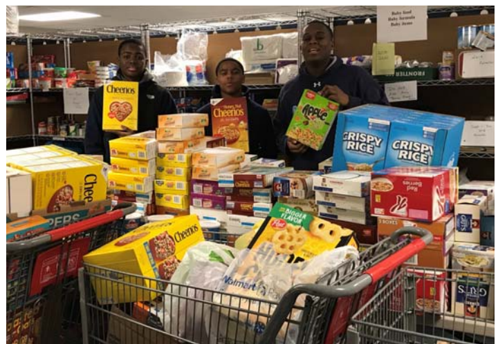
Members of the Greater Suburban Maryland Chapter of Jack and Jill of America held a cereal drive in February. They collected over 600 boxes of cereal for the Pantry. Great job!