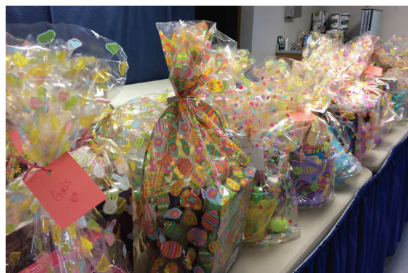
South Bowie Moms Club donated 25 beautiful Easter baskets for our children

It would be helpful if groups/individuals could check dates before bringing items to the pantry. While it is tempting to clean out your pantry and donate the food, it makes our job much harder. Anything you can do to make our job easier (and less back-breaking!) would be appreciated.