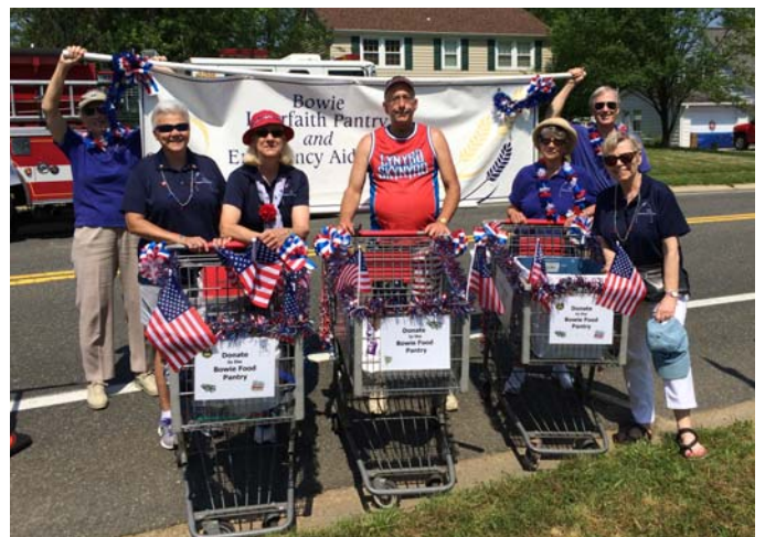
Volunteers marched in the annual Memorial Day Parade on Saturday, May 28. The weather was beautiful, and we enjoyed seeing so many familiar faces along the way.