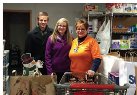
Home Depot sponsored a food drive in December. We appreciate their efforts to reach out to the community.