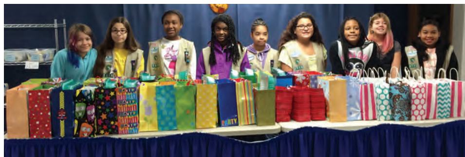
Girl Scout Troops 1019 and 2713 held a birthday celebration for founder Juliette Gordon Low. At the event, the scouts filled birthday bags with cake mix, frosting, and candles for our families.