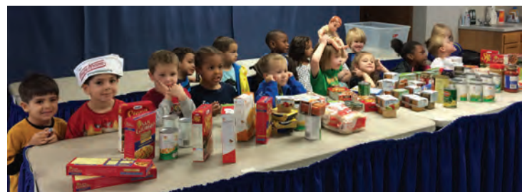
Students from the Belair Cooperative Nursery School donated a full cart of food! We look forward to their visit each year.