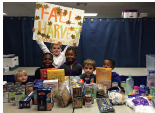
South Bowie Moms Club visited the Pantry and donated lots of food and personal care items. It is nice to see our young donors at the Pantry!