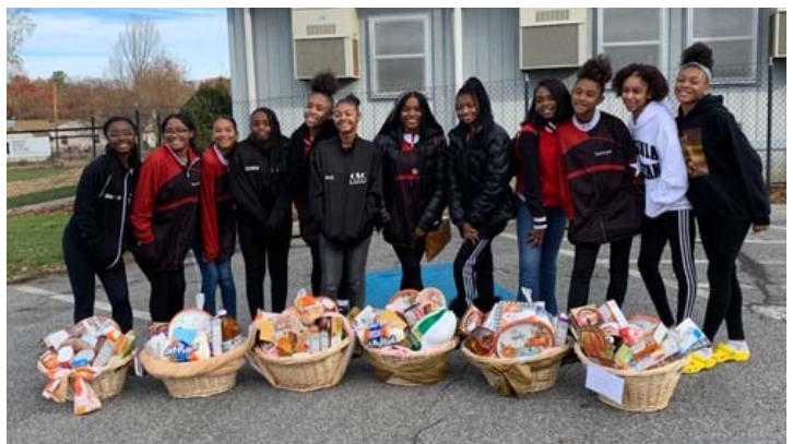
C & C Superstars/C & C Dance Company donated beautiful Thanksgiving baskets for our families.