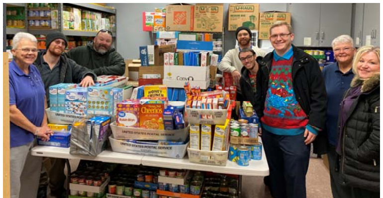
Employees of NASA Federal Credit Union collected and delivered over 6800 lbs of food this holiday season.