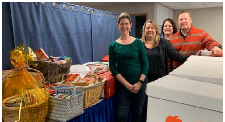
Employees of FTI Consulting participated in our holiday programs this year. They assembled and donated Thanksgiving baskets and adopted several children for Christmas gifts.

Whether you donate money, bring your donation to the Pantry or drop it off at one of our donation sites or local churches or temple, we appreciate your support. Every single item that you donate makes a difference. We could not do this labor of love without you!