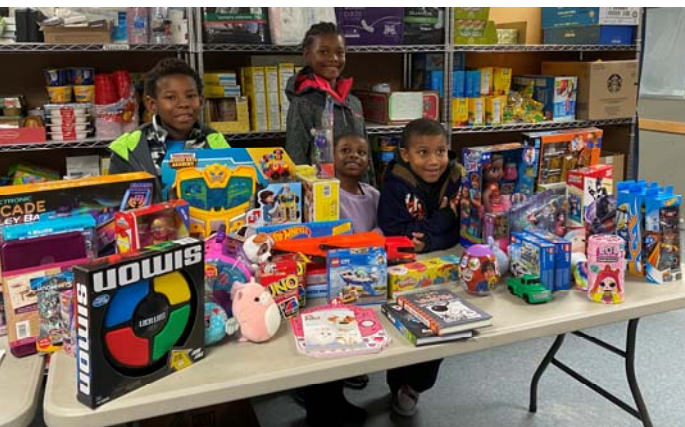
Members of United Parish of Bowie/Seeds shopped for and delivered toys for our annual toy room.