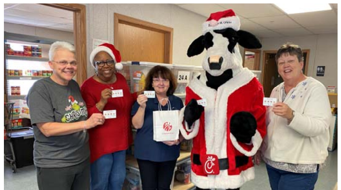
Chick-fil-A Bowie Marketplace donated 586 free-entree cards from their Delivery for a Cause program held in November.