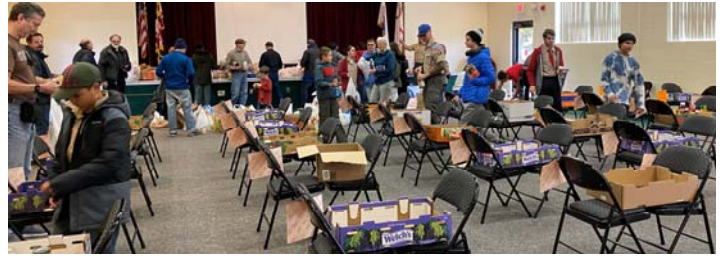
Scouts and pantry volunteers sort through donations collected during the annual Scouting for Food Drive.

The Annual Scouting for Food Drive took place on November 9, 2019. The Pantry appreciates all the hard work and effort by the scouts who placed bags on neighborhood doors and collected the food donations. A special thank you to all the Scout leaders and parents who make this event a priority year after year. It takes a lot of coordination, manpower, and dedication to make this drive a success. We look forward to the Scouting for Food Drive each year to fill our shelves until the holiday food drives begin. Many thanks to all who left bags of food for the scouts to pick up; your generosity is much appreciated.