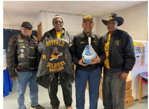
The Buffalo Soldiers of MD Foundation, Inc. donated frozen turkeys for our Thanksgiving baskets.