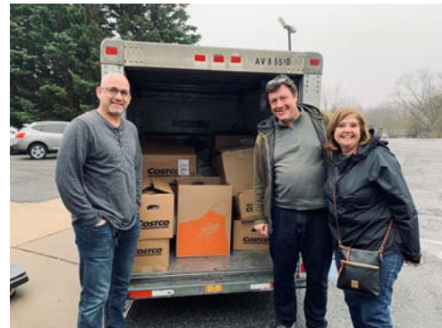
CISION employees collected 2,051.5 lbs of food for the pantry!