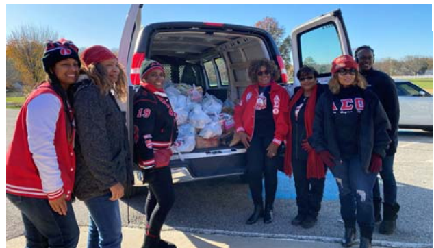
Members of Delta Sigma Theta, Inc./PG County Alumnae Chapter collected food donations at the Bowie Walmart in November.