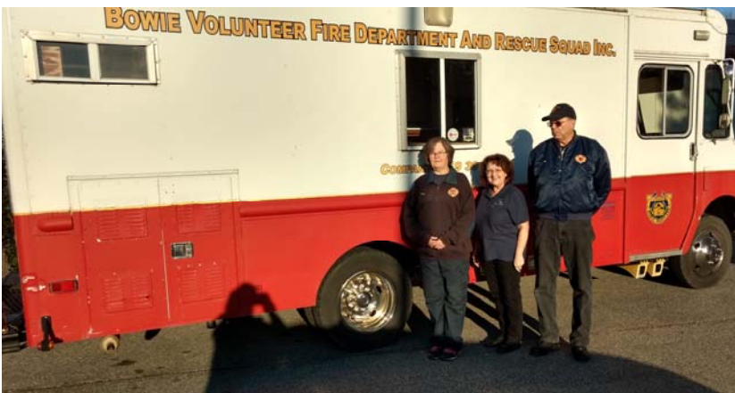
Thanks to everyone in the community who donated to Santa as he rode through the neighborhood—we received 17 full shopping carts of food!