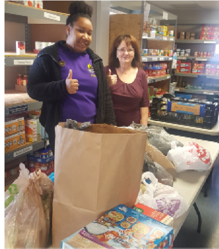
A big thumbs up for everyone who contributed to the Planet Fitness donation!

Whether you donate money, bring your donation to the Pantry or drop it off at one of our donation sites or local churches or temple, we appreciate your support. Every single item that you donate makes a difference. We could not do this labor of love without you!