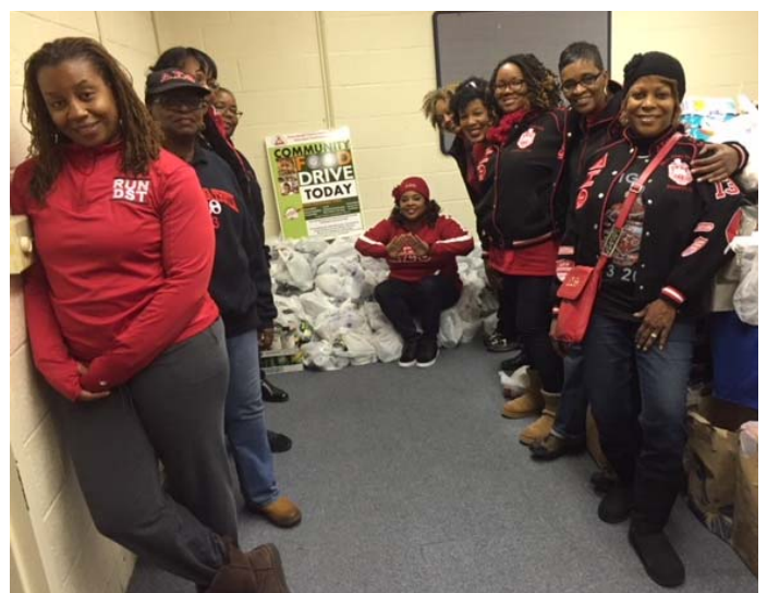
Members of Delta Sigma Theta, Inc held their annual food drive at WalMart; it was a great success!