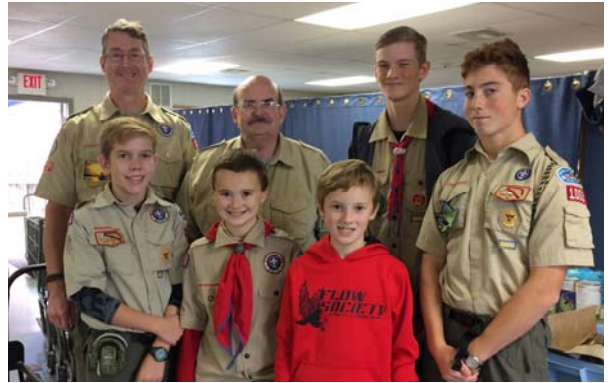
Members of Troop 1009 helped collect and sort donations during the Scouting for Food Drive. They also delivered Thanksgiving food baskets to families the following week.

The Annual Scouting for Food Drive took place on November 11, 2017. The Pantry appreciates all the hard work and effort by the scouts who placed bags on neighborhood doors and collected the food donations. A special thank you to all the Scout leaders and parents who make this event a priority year after year. It takes a lot of coordination, manpower, and dedication to make this drive a success. We look forward to the Scouting for Food Drive each year to fill our shelves until the holiday food drives begin. Many thanks to all who left bags of food for the scouts to pick up; your generosity is much appreciated.