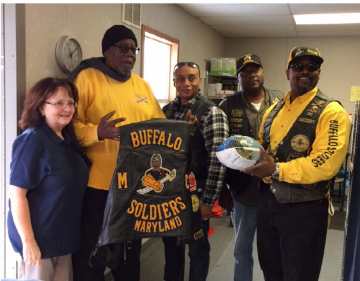
Members of the Buffalo Soldier Motorcycle Club of MD Foundation donated 20 frozen turkeys for our Thanksgiving baskets.