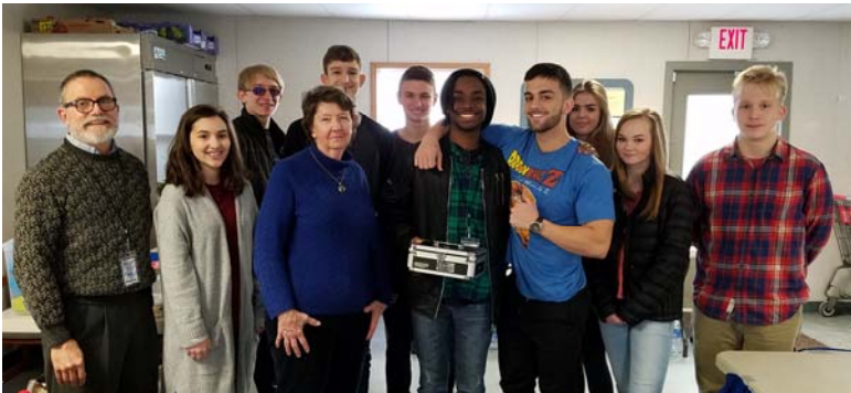
Students of Bridge Tutorial Ministries (Economics Class) raised funds for the food pantry by selling hot chocolate. What a yummy way to help the hungry!