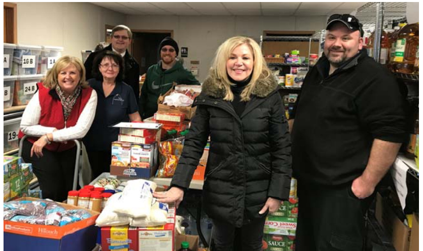
Employees of NASA FCU collected over 5,000 lbs of food for the Pantry.