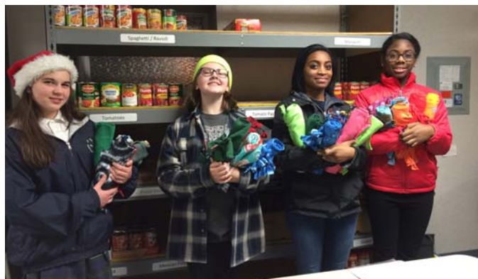
Girl Scout Troop 1052 made and donated scarves of many colors to the Pantry. Thank you for keeping our clients warm and stylish!