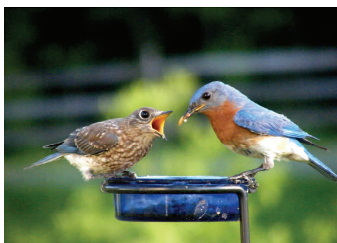
The photos above are examples of the beautiful artwork that Dick has framed and sells at area fairs and festivals to benefit the Pantry.